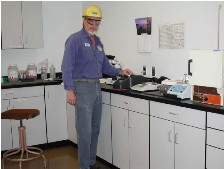
Figure 3 – Synthetech Conducts Daily Tests for Ammonia

The City of Albany also monitors Synthetech effluent for BOD and Suspended Solids on a bi-monthly basis, and for 64 VOCs on a monthly basis at unannounced sampling times determined by the City.