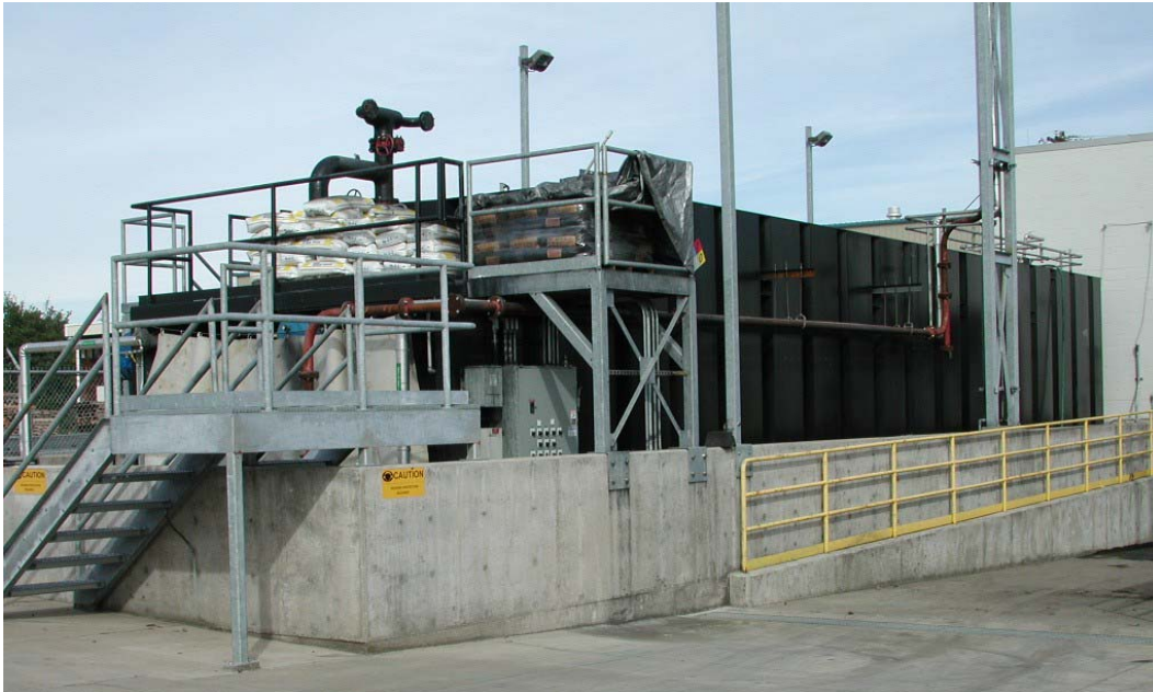
Figure 2 – Installed and Operating PACT® System

The system treats the wastewater using powdered activated carbon in combination with microorganisms in a water matrix, and uses diffused air to ensure that the mixture remains homogeneous. The diffused air also ensures that the microorganisms in the system are given sufficient oxygen so that biodegradable organics are biologically stabilized. The activated carbon initially adsorbs much of the contaminants like VOCs and other organics, the VOCs/organics becoming the substrate upon which the microorganisms live. This allows the microorganisms to have opportunistic access to the contaminants, making them far more efficient in the process of oxidizing/destroying the sorbed organics.